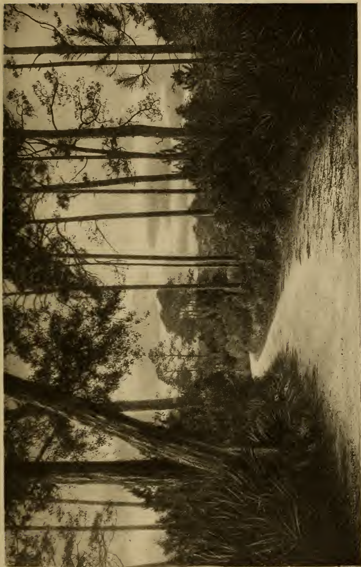
L A N I E R R O A D